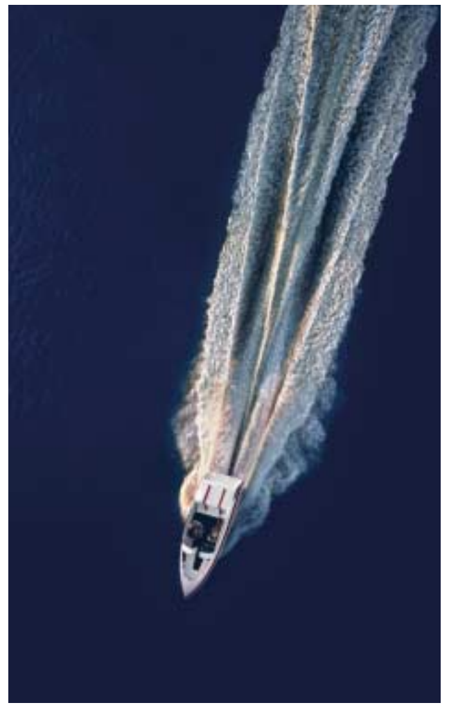
Many boaters have found that EFI is the most important boating improvement of their lifetime.

A key benefit of electronic fuel injection is instant starts in all kinds of conditions.